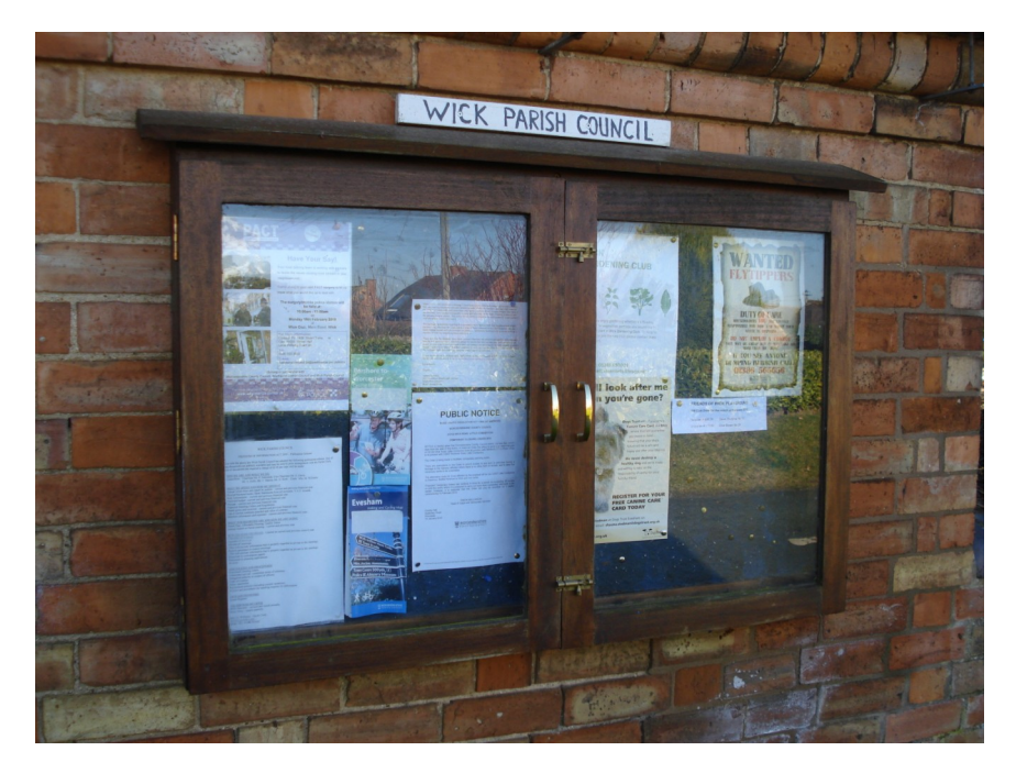
Photo: One of the parish notice boards displaying parish news and crime prevention advice.

• To involve the Community Liaison Officer more in Parish activities.