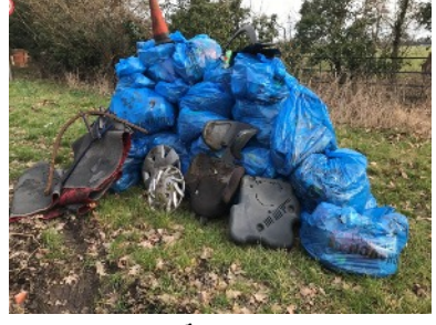
Stock and Bradley - Chronicle - Worcestershire - 6

As usual pickers, tabards and gloves will be provided, but please return them! This was the result of last year's efforts, our best turnout yet – well done everyone!