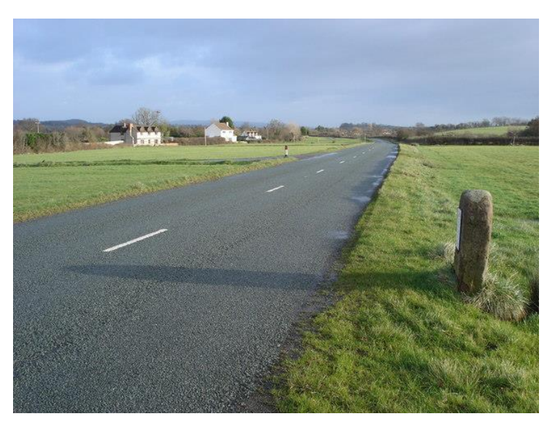
Milestone on B4211, Corse Lawn Common, Grade 2 listed

"Corse Lawn regulated pasturelands is divided into 342 stints (sheep pasture). Each sheep pasture allows one sheep to pasture on the regulated pastureland. Two sheep pastures allow pasture of one other animal under one year old, three sheep pastures allow pasture of one other animal under three years and five sheep pastures allow pasture of a milk cow or other animal over three years. No pigs are allowed to pasture on the regulated pastureland. Pasture owners can de-pasture their animals over the whole of the pastureland." 2