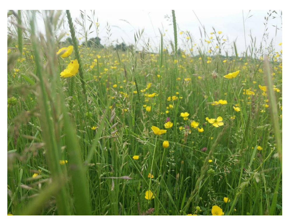
Wild Flower Meadow