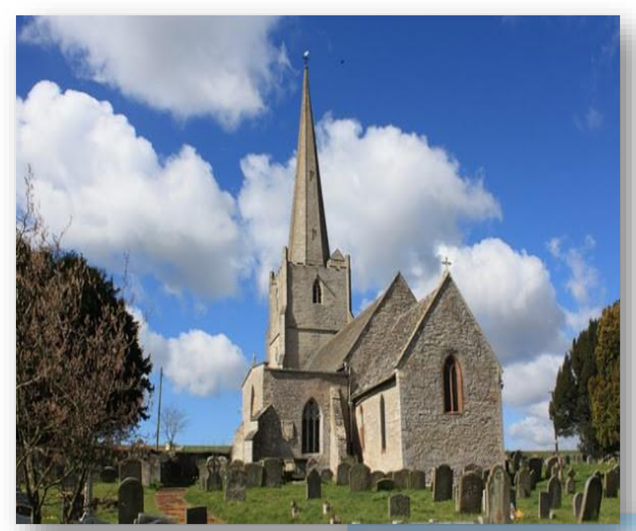
St. John The Baptist, Eldersfield