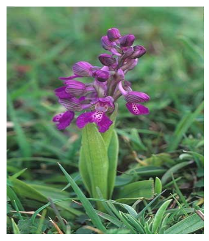
Green winged orchid

The character of the wildlife is mainly dominated by ancient grassland with wildflowers such as great burnet, meadow foxtail, meadow barley, knapweed and pepper saxifrage and their associated wildlife. This wildlife includes skylark, lapwing, curlew, brown hair and otter. In Poolhay Meadows there are several plant species that are scarce in the County; rushes, cuckoo flower and ragged robin grow in the wetter areas; orchids, great burnet and adder's tongue in the remainder. Corse Lawn also contains some areas of damp ground, with a number of black poplar pollards. To the south of the Lawn is Avenue Meadow, a rich unimproved grassland with orchids and cowslips.