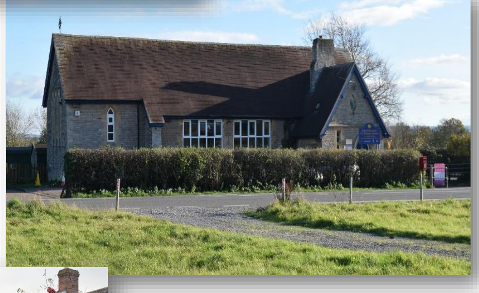
Eldersfield Lawn C.E Primary School