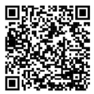
Scan for our website Select 'G' for Grimley Access all documents including this agenda

Date of publication of this notice: 29/08/2023