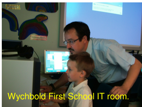
Wychbold First School IT room.

Dodderhill Parish has no secondary schools or colleges. Wychbold First School, which experienced some difficulties a few years ago, has been turned around and is now thriving and exceeding Education Authority standards - a recent OFSTED examination placed it at 'borderline outstanding'.