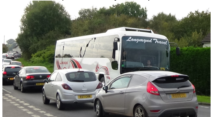
Traffic Chaos in Shatterford on the A442

This Parish newsletter advised everyone in the April edition that this event was going to take place, and yet it still caught out many people, despite efforts to publicise it. The main problem locally was the closure of the A442, causing traffic mayhem in Shatterford, and the closure of the Habberley Lane. In effect these two closures cut off much of the parish from access to Bewdley or Kidderminster from 7.30a.m. to 2.30p.m. on Sunday 24th September.