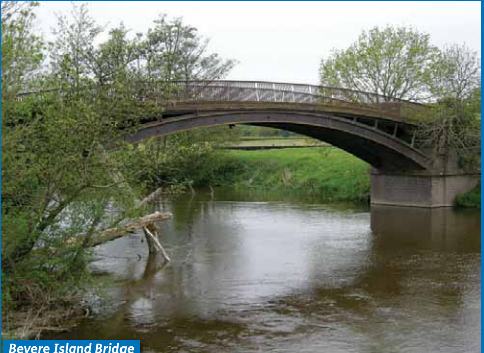
Bevere Island Bridge built 1844