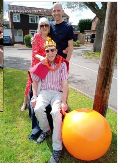
At the Coronation Street Party