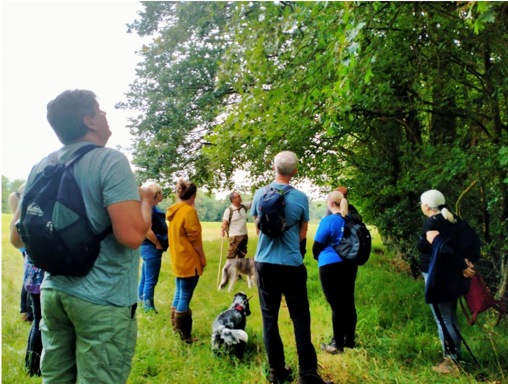
Tree Warden leading a walk through the Parish