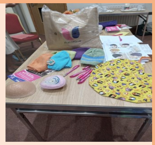
Members of the Craft group made underarm breast cushions.