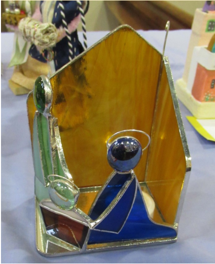
A candle illuminated Sheila Lynes's colourful glass Nativity .