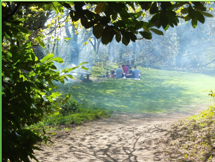
Near Earnslaw Quarry

A decisive vote at the Malvern Hills Trust's public board meeting on 17 th October means they will introduce a private bill to Parliament on 27 th November. This is a proposal for a law affecting a single organisation like theirs and opens up the proposed governance changes to full public scrutiny. During the summer, you had the opportunity to have your say on the proposals for taking the Trust into the 21 st century. Trustees carefully analysed nearly 500 pieces of feedback and have now published this and a report on changes to the Trust's proposals as a result www.malvern hills.org.uk/governance-changes/consultation