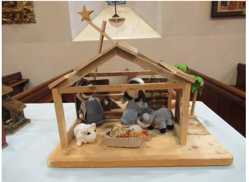
Loaned by Marguerite and Alan Barnwell, this scene is crocheted in cotton and stuffed with wadding once used to protect delicate fruit in a delivery box. The stable is made from an old pallet.