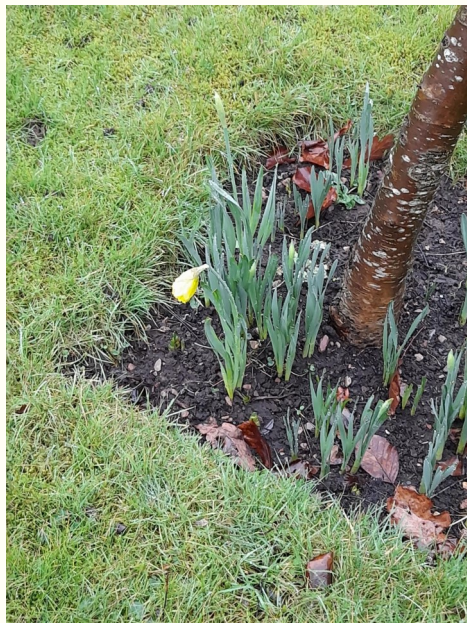
Daffodils - a welcome sign of spring

I have to say I welcome the recent warm weather. It is so much more fun to be able to walk around without a great big puffy coat on to keep warm.