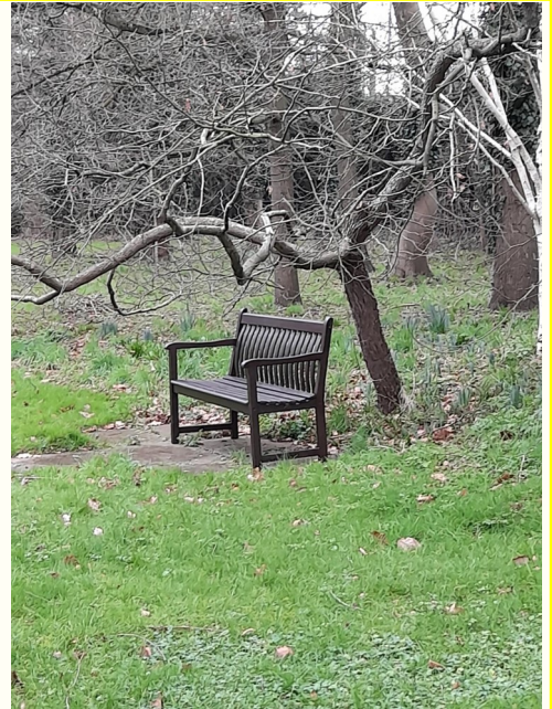
A cold, crisp morning at the Beauchamp

Two weeks later and the tête a têtes are blooming and putting on a strong display and finally you know spring has sprung. The other sign is the gardeners out and about with wheelbarrows tidying up ready for the upcoming planting season.