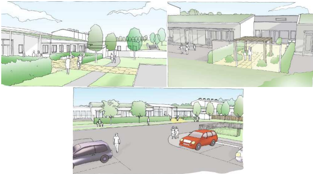
Artist's Impressions of the new Chaddesley Corbett School

The Village, Bellington, Bluntington, Brockencote, Cakebole, Hill Pool, Drayton, Harvington, Lower Chaddesley, Mustow Green (East), Tanwood, Winterfold, Woodrow, Bourne Green