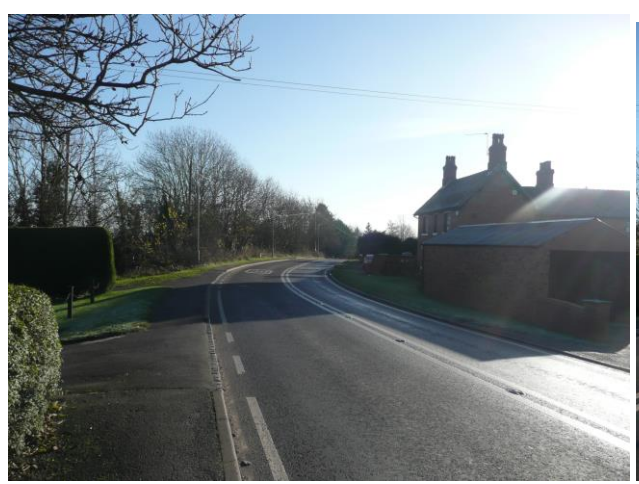
FIGURES 4.1 – 4.2: Proposed crossing point to access public footpath to industrial estate

In addition to this, in order to try to persuade the planning authority that the PROW is an effective footpath, they expect pedestrians to stand on the driveway of 'Sunnymead' to cross the road at a point east of a curved humpback bridge where motorists and HGVs are travelling from a 40mph speed limit (we have already established they are travelling at least 38mph further down the road where they are slowing) on a downhill gradient whilst watching for oncoming traffic due to the narrow nature of the bridge. This supposedly appropriate and safe crossing point was, earlier in 2014, the scene of an accident whereby a Light Goods Vehicle was unable to traverse the bend effectively and ended up in the hedgerow.