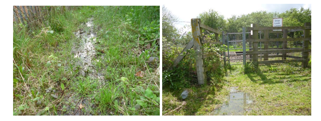
FIGURES 6.3-6.4: Waterlogged conditions on footpath and railway crossing adjacent to path