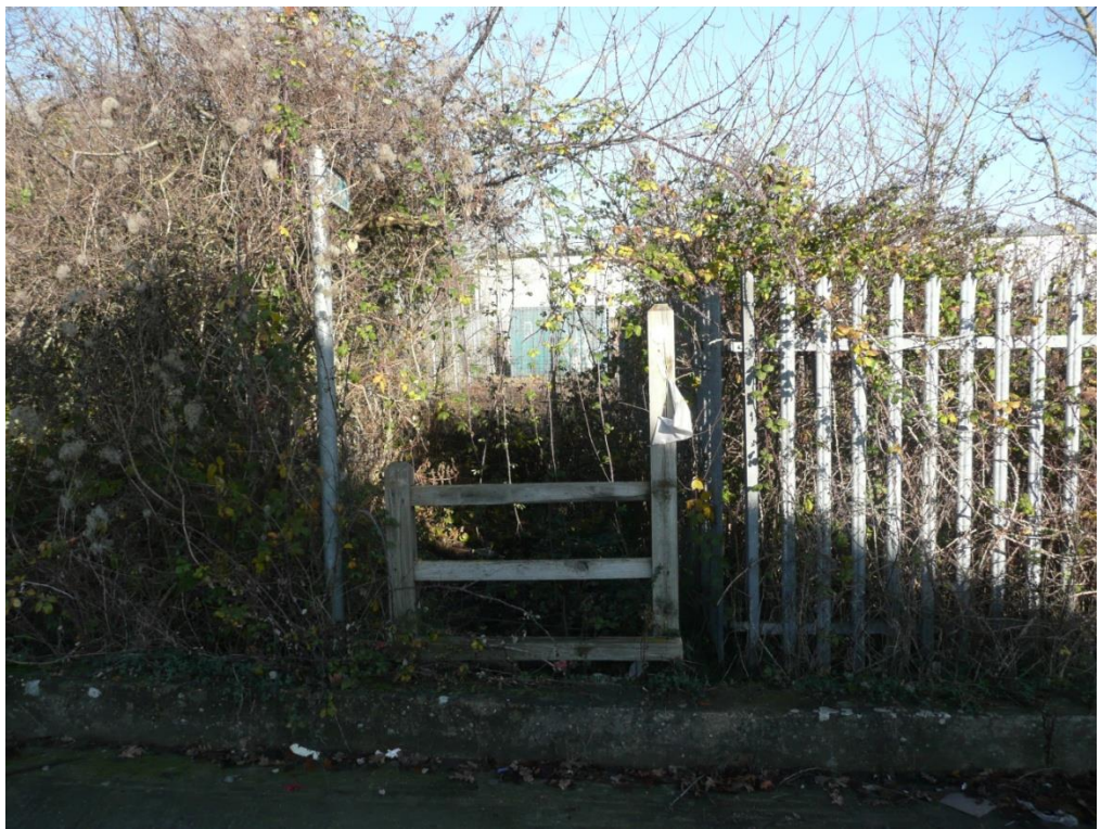
FIGURES 6.9 & 6.10: Stile entry into Pershore Trading Estate