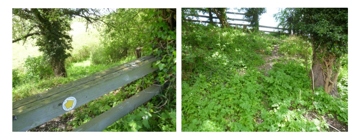
FIGURES 6.1-6.2: Stile access from Wyre Hill and embankment from the stile to footpath