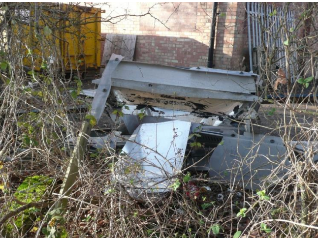
FIGURES 6.5-6.8: Conditions along the footpath on approach to the Industrial Estate