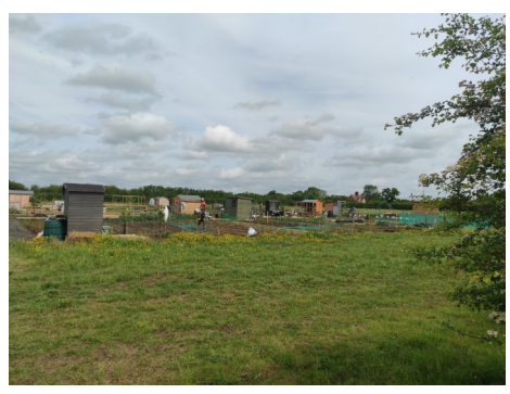
Allotments May 2022