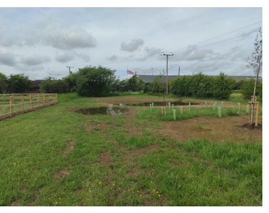
Wetland May 2022