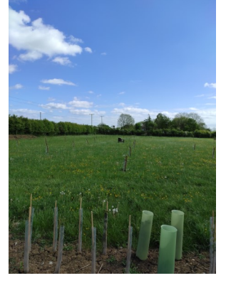
Hedge, orchard and bench