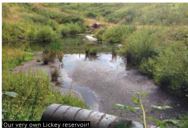
Our very own Lickey reservoir!

There were grave misgivings that Faber Maunsell had not accepted responsibility for their part in the problem, and it was felt that their professional standards should be questioned even though BDC had no contractual relationship with them.