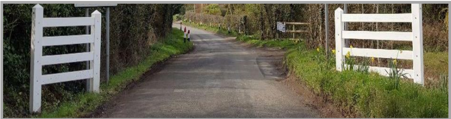
Gates shown are for illustrative purposes only.

The way had been prepared for this to happen and we had received a license from the County Council to proceed. Just three days prior to work starting our permission was revoked! The gates and our contractor were ready but everything was stopped. We now await a further discussion about possible compromises to our proposals and whether the project will be able to go ahead after all ?