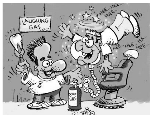
Take Nitrous Oxide, for example. Known as 'laughing gas' it was first made in 1772 by Joseph Priestley. After years of social use it was

There are many well known (and publicised) drugs that can be addictive. By that we mean that once one is snared by the 'pleasures' of the drug it is very difficult to shake off the habit. Unfortunately, many addictive drugs become less potent as time goes by, and the addict needs more and more to satisfy his/her craving. They are well and truly 'hooked' on that drug. Then they turn to the stronger or fashionable drugs, many of which are more dangerous but may have perfectly good uses within the medical scene.