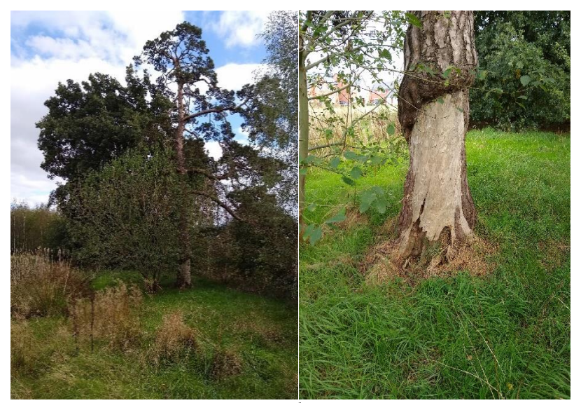
Pine Tree Copcut Lane with 2<sup>nd</sup> photo showing damage at the base

Contractors on the Copcut Rise development appear to have maintained pre-existing trees (as I can remember). There are some issues with new plantings (a lot of the new trees haven't survived). There is also an issue with residents cutting through to Copcut Lane via unofficial paths. There appears to be only one path to the lane which is right at the bottom close to the railway bridge. <u>Highlights</u>